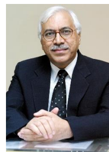
Dr. SY Quraishi Former Chief Election Commissioner of India, and Chancellor IILM University Gurugram. He has also authored 'An Undocumented Wonder- The Making of the Great Indian Election'.