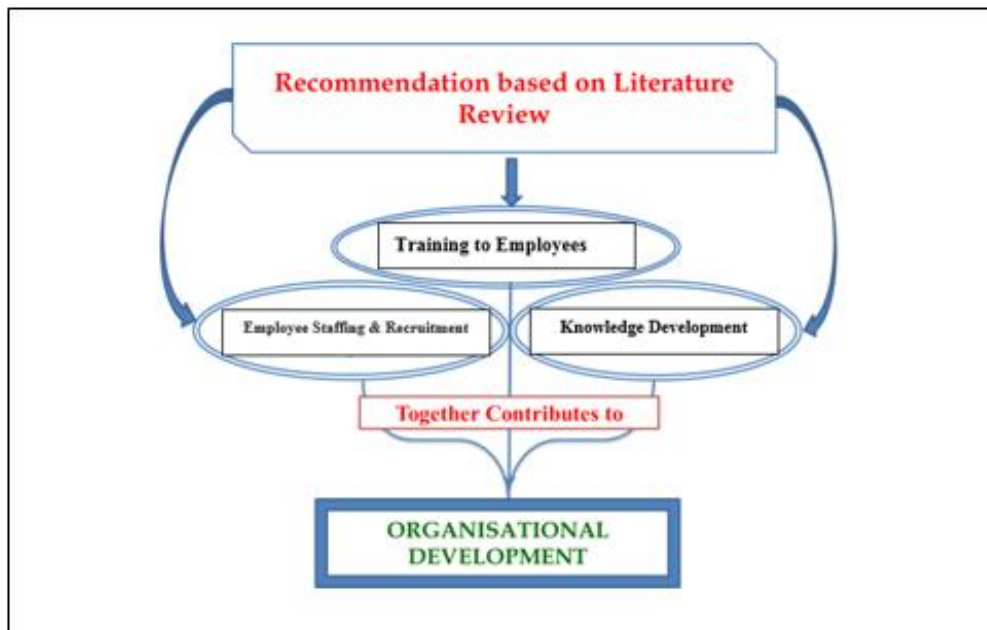
Chart No. 2: Recommendation: Researchers' Understanding